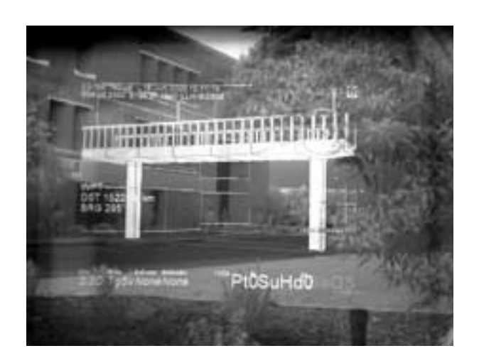
Figure 5: Proposal One Bridge

As a second application domain for the use of our outdoor AR system, we are investigating how to improve the visualisation of architecture designs. The first question to ask is – Why an architect may use this tool? An AR visualization tool will aid architects in conveying their ideas to their prospective clients. A common