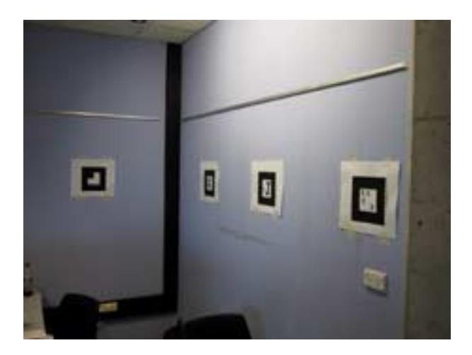
Figure 4: Fiducial marker on the wall

that they would be usable by the system regardless of whether the user was very close or very far from the wall. In this case, we chose to use patterns that were a size of 19 cm^2 . From testing, we found that the system could register a pattern at a range of 22.5 cm to 385 cm from the wall. In a 8 x 7 m room this range would be sufficient (for the initial stages of the project) and an accuracy of within 10 cm at the longer distances. It is important that no matter where the user looks in the room that, at least one pattern must be visible in order to provide traking. For this reason, we realised that to implement the patterns on the walls as the sole means of tracking would require different size targets. We are investigating the use of targets themselves as patterns inside larger targets; therefore one large target may contain four smaller targets when a user is close to a target.