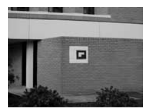
Figure 3: Fiducial marker on a building

When using ARQuake with the GPS/compass tracking less then 50 metres from a building, the poor occlusion of monsters and objects near the physical buildings, due to GPS error, becomes more apparent. As the user moves closer to buildings, inaccuracies in GPS positional information become prevalen t. The system is now required to slave the Quake world to the real world, and furthermore in real time. As an example when a user is ten metres from a building their position is out by 2-5 metres, this equates to an error of 11-27 degrees; this is approximately a half to the full size of the horizontal field of view of the HMD. When the error is greater than the horizontal field of view, the virtual object is not visible on the HMD.