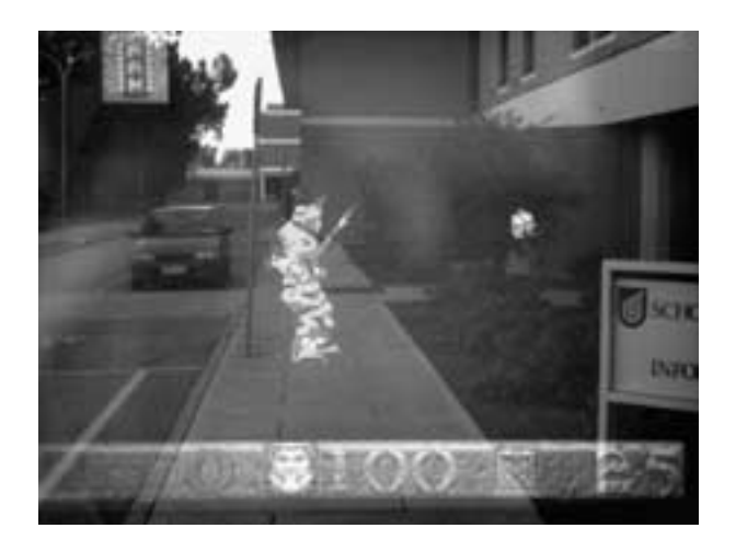
Figure 2: User's Heads Up Display

The tracking of the user's position and orientation of the user's head handles the majority of the interaction